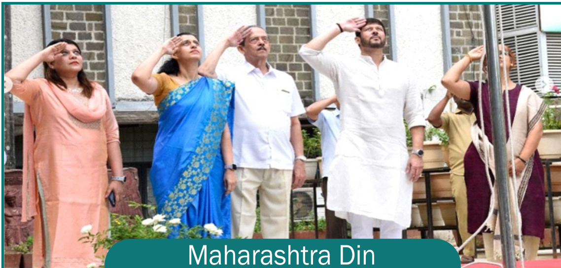
International Workers' day